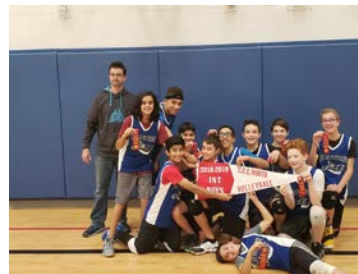
Sr. Boys Area Volleyball Champions!